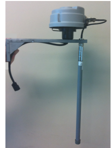
Optional High Gain Antenna

Additionally, the mounting kit supports the ability to add a high gain antenna .